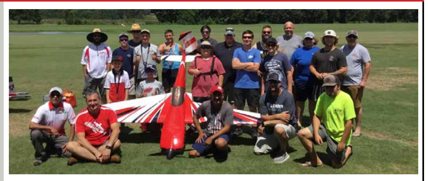
The 2022 Youth Masters was another stunning success. This event is crucial to passing on the knowledge and passion of IMAC flying for excellence.

For those that attended and supported this event, it represents so much more than just flying at a world class facility. It's a lesson in being humble, in creating freindships, in good sportsmanship, and most importantly a reminder that the biggest gift we have for our youth is to share our time.