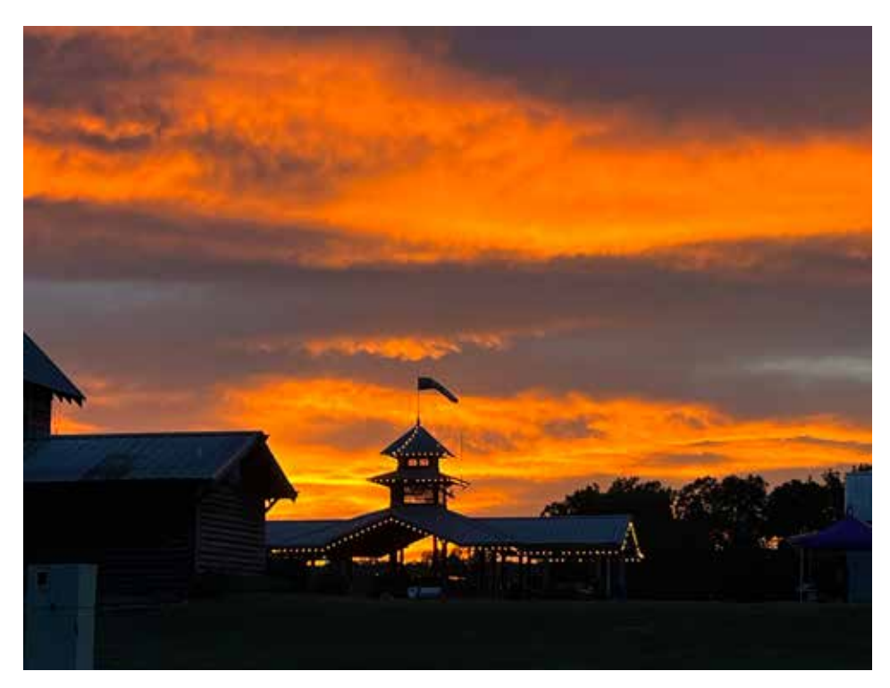
An incredible sunset view of the Triple Tree Aerodrome facility from the 2022 Youth Masters Event.